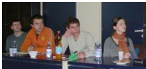
The SIFE Team from Maribor

REMINDER: Be aware that all your projects in other countries, with teams from other countries in your country or with teams from other countries in their / third countries have to be registered! GORT is accessible online at http://www.sife.org/GORT