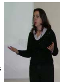
Explaining the Criteria

The presentation of the results showed great creativity and everybody agreed on the benefit of this session. Another important topic was the building of a sustainable team. All the workshops were accompanied by best practice presentations from experienced SIFE students. After 5 intensive hours of work, the teams left Ljubljana with a deeper understanding of SIFE and keen on carrying out their SIFE projects for this year. It is going to be an interesting competition in 2007!