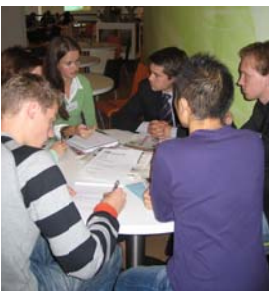
Developing a project

On the 23rd October SIFE the Netherlands held its yearly Training Conference at the Unilever headquarters in Rotterdam. Almost 50 students from 8 SIFE teams attended the meeting and the overall feedback showed that the day was a big success.