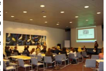
Opening of the Day

It was a special day not only because of the training day, but also because it was the first time SIFE Netherlands had invited its alumni students to get together. This year SIFE Netherlands will set up an alumni network to be able to keep in touch with those students that graduate. We hope that the students will continue to be involved with SIFE and help SIFE Netherlands with its growing activities so that