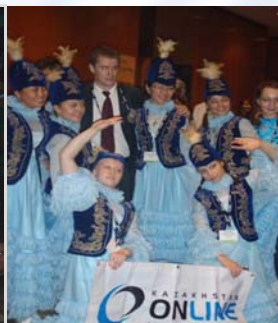
At the Cultural Fair, the Kazach team