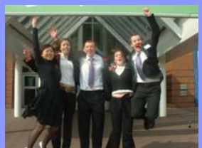
SIFE Lancaster at the British National Competition 2005