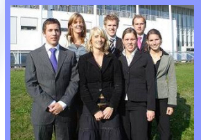
The team from the Business Match Groningen