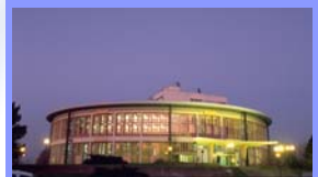
The Library of USTL at night