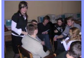
A seminar at the School of Leadership