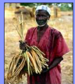
Collecting the seed in Burkina Faso