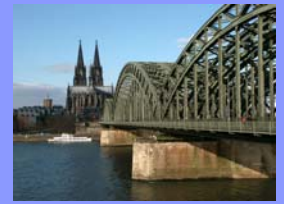
The dome of Cologne and the Rhine Bridge