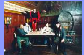
Dr. Faust and Mephisto in Auerbachs Keller