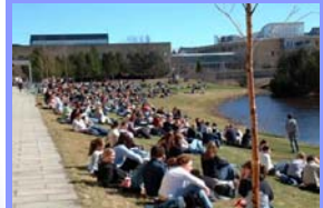
The Campus of Umeå University