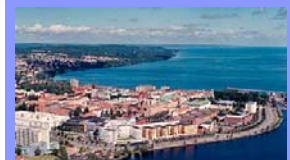
The coast of Jönköping