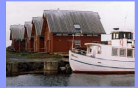
Strompilen - Impressions of Umeå

After explaining the stakes of the equitable trade, the system and criteria the team will show the cooperative members how to contact distributors and organizations of certification, in order to be recognized as a fair trade cooperative. Another part of the project contains of marketing, accounting, budgeting and investment, and strategic management