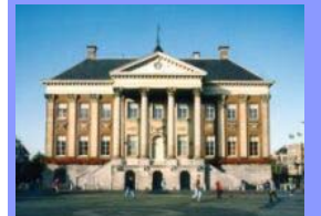
The townhall in Groningen