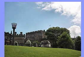
Lancaster Castle, landmark of the city