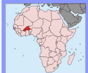
Map of Africa – Burkina Faso