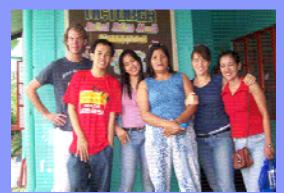
SIFE Utrecht in the Philippines